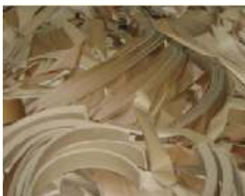
Waste from furniture manufacturing