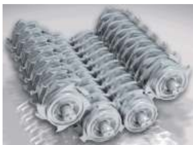
Cutting shafts (schematic)