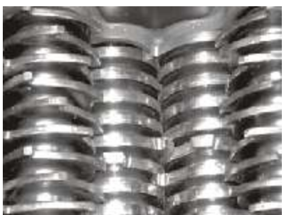
Cutting and clearing plates

GZ series four-shaft shredders are ideal to shred and recycle very long and oversized wood waste such as mature timber, long boards, pallets, packaging, and cardboard of any kind. Four-shaft shredders are mainly used in the wood processing industry.