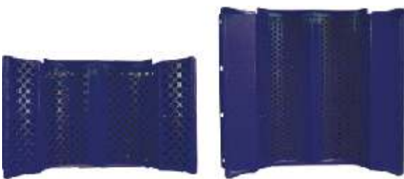
Screen with different perforation