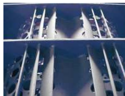
Screen with secondary crusher bars